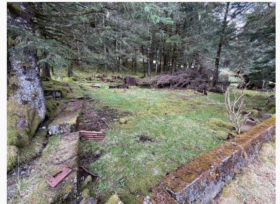
Remains of the Orphanage that burned down in 1925 and 1937