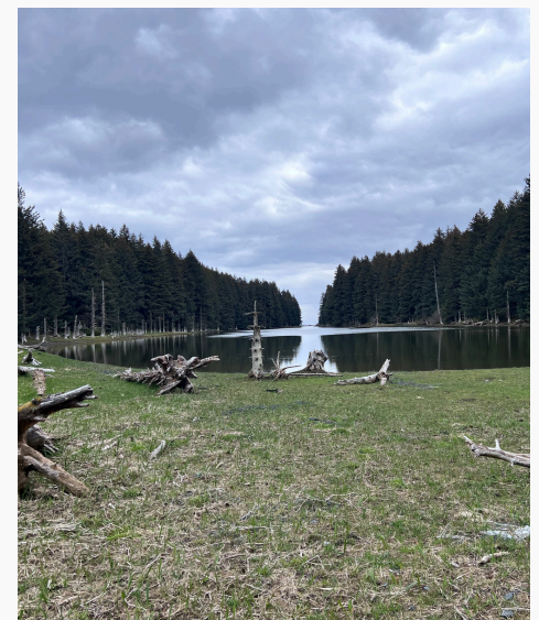
Interior end of Crab Lagoon