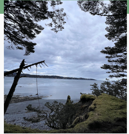
Looking out towards Kodiak from Woody island

Other partners that have contributed monetary support include Leisnoi, Inc. and Koniag, Inc. We look forward to sharing the findings and our plan to honor and protect the sites of our buried ancestors.