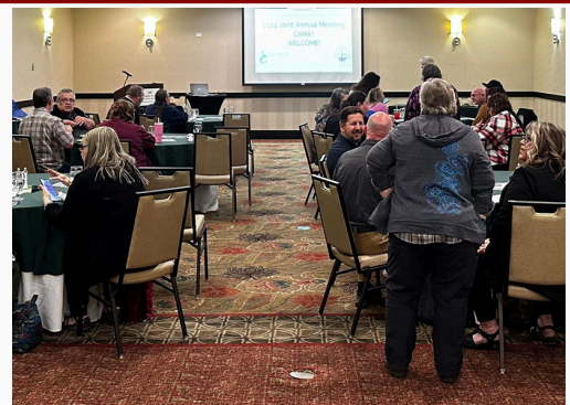
Tribal Citizens visiting and catching up with each other