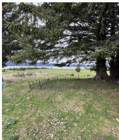
Location of one of the mass burial sites that had fencing added later