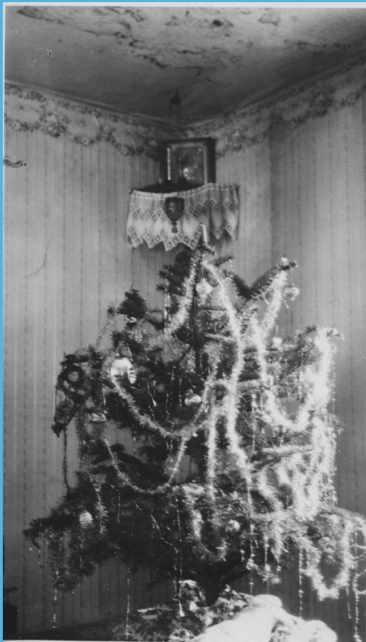
Christmas tree from Woody island Archives

In Kodiak many Alutiiq families celebrate both American Christmas and Russian Christmas