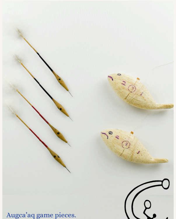
Augca'aq game pieces.

Augca'aq is a marine mammal hunting game that in some areas is still played to this day. To play teams would kneel on the floor as if sitting in a kayak and throw darts at a wooden porpoise dangling from a string. The goal is to score twelve points, which are awarded based on the location of each strike